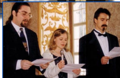
Top: ITI Priests and Seminarians with His Eminence Christoph Cardinal Schönborn, Bottom: The ITI's First Graduating Class, May 1997