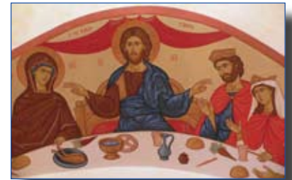
The Wedding Feast at Cana

The couple is shown wearing crowns because in the Eastern rite, the Crowning ceremony is the wedding ceremony. As