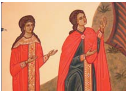
Adam and Eve