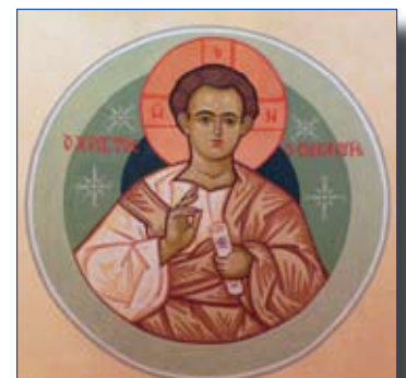
Emmanuel - Christ as a little child

see that the green color goes from light to dark, symbolizing the fact that as a person studies theology he goes from the more well known to the less well known. As you study more, you penetrate deeper into the mysteries of theology. On either side of the entrance door there are two archangels: St. Michael and St. Gabriel.