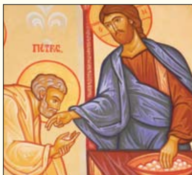
Christ giving Holy Communion to Saint Peter