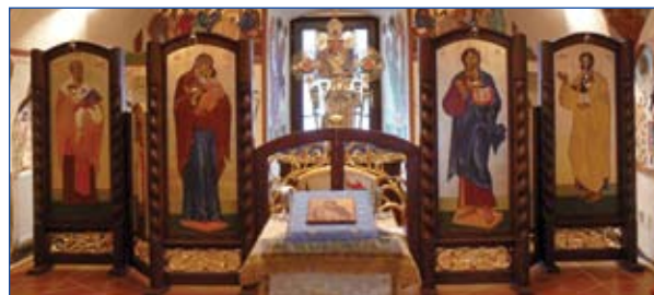
The Iconostasis in the Byzantine Chapel

Separating the Sanctuary from the rest of the chapel is the Iconostasis. St. Nicholas