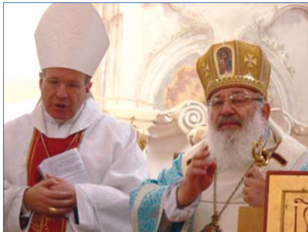
Cardinal Schönborn and Cardinal Husar at the Chapel Consecration.