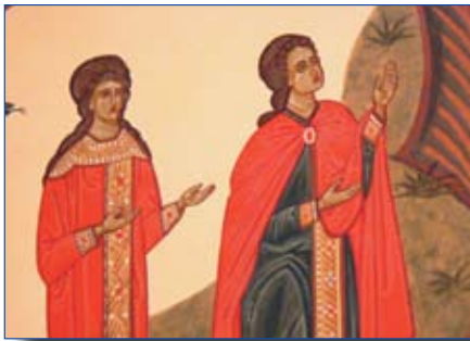
Adam and Eve