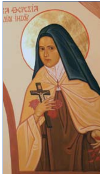
Saint Thérèse of the Child Jesus