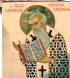
The Holy Spirit and Saint Cyril of Jerusalem

with us, the Great Fathers of the East and West are depicted, showing the unity of East and West: St. Ignatius of Antioch; St. Augustine; St. Gregory of Nyssa; St. Gregory Nazianzen; St. Basil the Great; St.