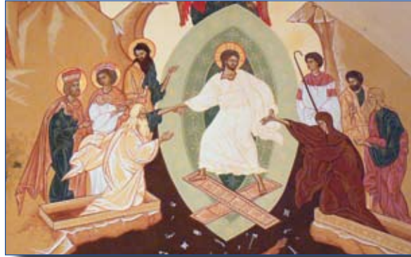
The Resurrection of Christ

On March 25th, the Feast of the Annunciation, the chapel was consecrated. (See article on Page 1) Now it is not only a work of art that teaches theology, but a sacred space set aside in which to worship God. Words cannot express all that is contained in this little chapel. You must come and see it for yourself. ✂