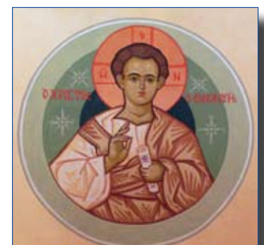
Emmanuel - Christ as a little child

to dark, symbolizing the fact that as a person studies theology he goes from the more well known to the less well known. As you study more, you penetrate deeper into the mysteries of theology. On either side of the entrance door there are two archangels: St. Michael and St. Gabriel.