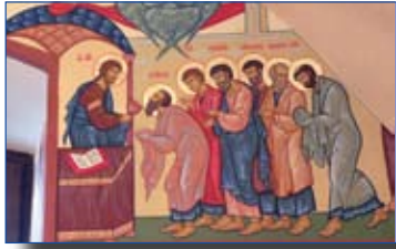
The Communion of the Disciples

munion from Christ. Christ is depicted in His full Eucharistic presence under the species of bread (Body) and wine (Blood).