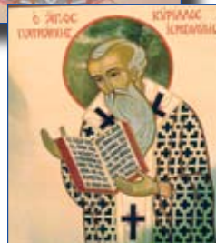
The Holy Spirit and Saint Cyril of Jerusalem

When you come into the chapel and see these saints at your level, it symbolizes that you are coming into the community of the saints to pray with them.