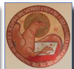
The Four Evangelists, Matthew, Mark, Luke and John.