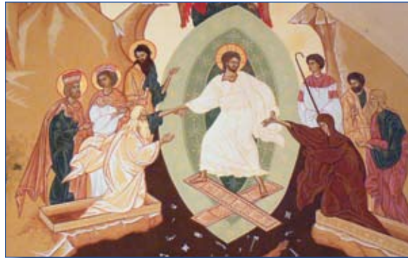
The Resurrection of Christ

On March 25th, the Feast of the Annunciation, the chapel was consecrated. (See article on Page 1) Now it is not only a work of art that teaches theology, but a sacred space set aside in which to worship God. Words cannot express all that is contained in this little chapel. You must come and see it for yourself. ✂