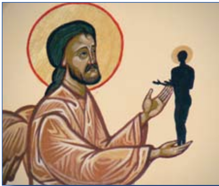
The Creation of Adam

who represents the presence of Franciscan University of Steubenville in the Kartause; St. John Damascene; St. Makrina, the sister of St. Basil the Great; St. Thomas Aquinas; and Sts. Cyril and Methodius, the apostles of the Slavs. When you enter the chapel and see the images of the saints depicted on the same level with you, you realize that you are entering into the community of saints to pray with them.