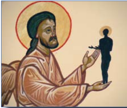
The Creation of Adam

who represents the presence of Franciscan University of Steubenville in the Kartause; St. John Damascene; St. Makrina, the sister of St. Basil the Great; St. Thomas Aquinas; and Sts. Cyril and Methodius, the apostles of the Slavs. When you enter the chapel and see the images of the saints depicted on the same level with you, you realize that you are entering into the community of saints to pray with them.