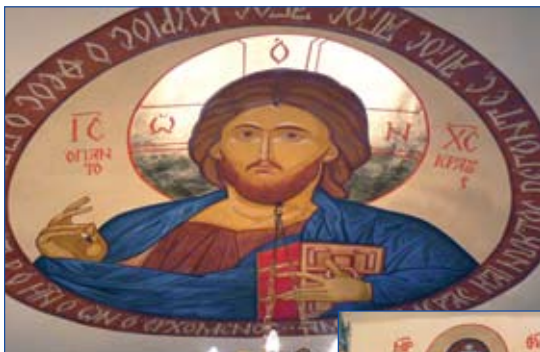
The Pantokrator and the Oranta