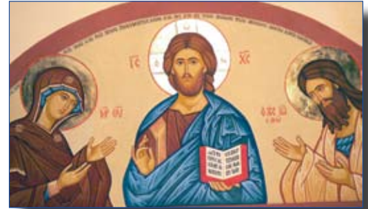
Deesis - "Behold the Lamb of God"

When you look on the right side of the chapel, there is an icon