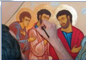
Preparing the ceiling, sketching the icons on paper and “writing” the icons